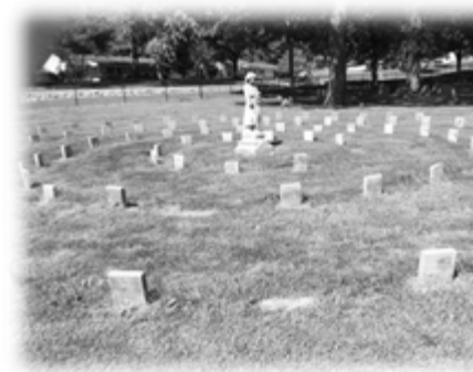
A circle of infant and child graves at Mount Muncie Cemetery in Leavenworth.

In lieu of having a funeral home pick up the stillborn or infant remains from the hospital, some families choose to transfer the remains on their