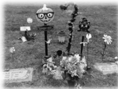
An infant's grave at Resurrection Cemetery, one of the area's Catholic cemeteries that have a designated infant burial area.